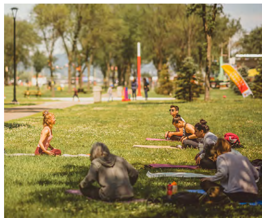
Mathieu Bélanger / ULaval