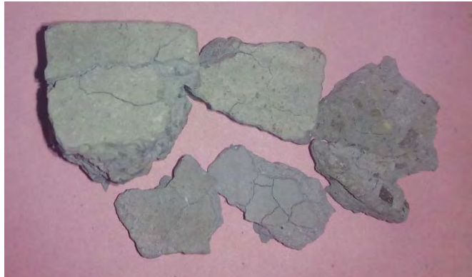
Figure 3. Mixture 5 after autoclave test

The results obtained after the test described in section 3.3 could be considered, in general, as satisfactory. The samples of mixes 3, 6 and 8, containing EAF slag have mostly conserved the volumetric integrity. However, samples of the mixes 4 and 5 (containing a notable amount of LF slag) have been destroyed; in Figure 3 it can be appreciated the result for the mixture 5. It is evident that the use of this kind of slag must be limited to lower values to avoid this default.