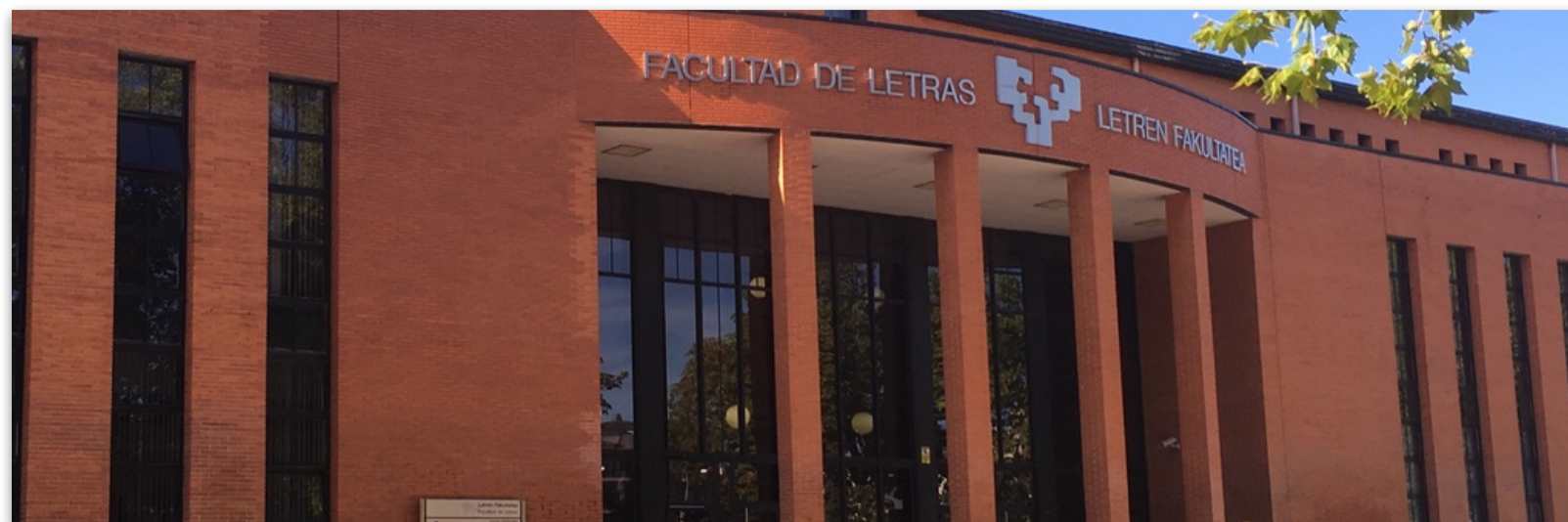
Faculty of Arts, University of the Basque Country (UPV/EHU)

During the on-site week, from May 13 to 17, several sociocultural agents from the Basque Country, representatives of associations, NGOs or cultural institutions such as the UNESCO Etxea or the Etxepare Euskal Institutua , will participate in the course. In a workshop designed and animated by Hibridalab ,