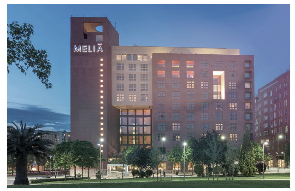
Address: Zubiarte Shopping Centre, Leizaola Lehendakariaren Kalea, 29

DINNER Collective dinner. Meliá hotel restaurant, a short 5" walk from the venue.