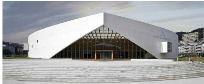
Centro Carlos Santamaría