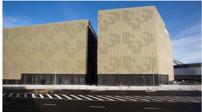
Escuela de Ingeniería