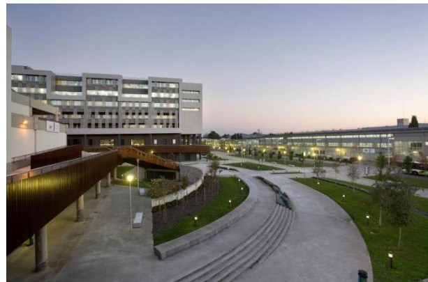
Vistasgenerales Area Leioa-Erandio